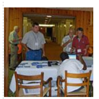
The conference begins with registration in the lobby of the hotel.