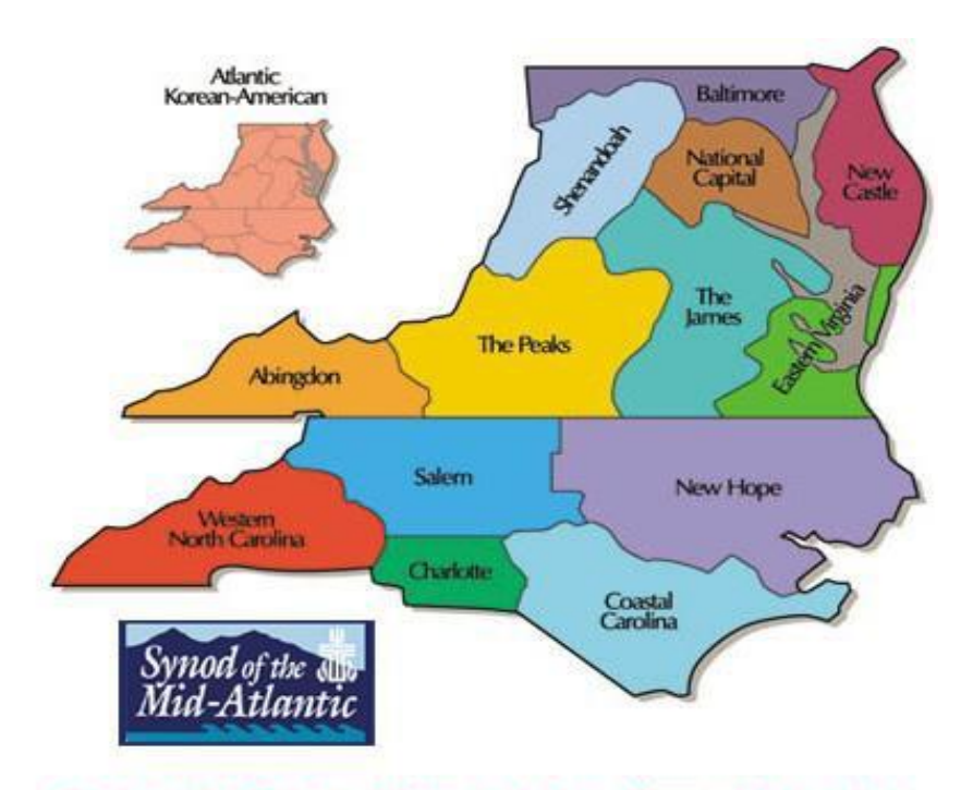
Point & Click Map of the Presbyteries in the Synod of the Mid-Atlantic