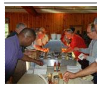
One of the highlights of the