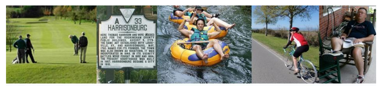
The conference allows time for golf, an historical tour. hiking, tubing, biking or time to inspect your eyelids for cracks