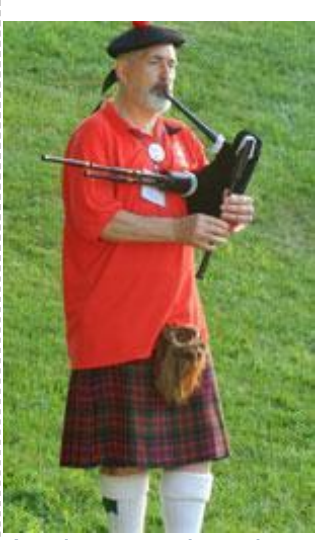
Attendees were awaken each morning to the sound of the Pipes.